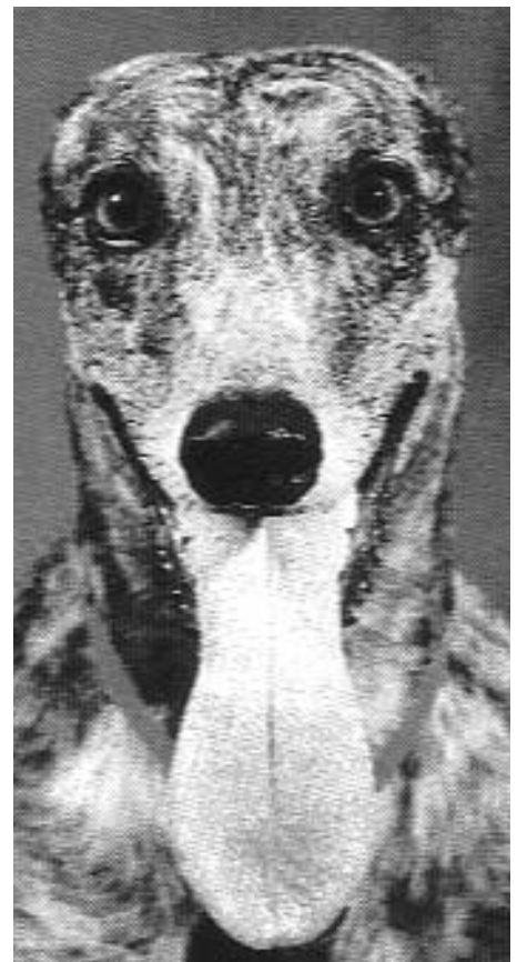
Is this raspberry a comment on the next dog wash?