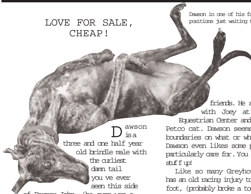
Dawson in one of his favorite positions just waiting to be scratched!

Dawson is a three and one half year old brindle male with the curliest damn tail you've ever seen this side of Farmer John, (he even won a award for his tail and has a ribbon to prove it)! Dawson could be the only four legged member of his new family but thrives with his other dog, cat, and horse